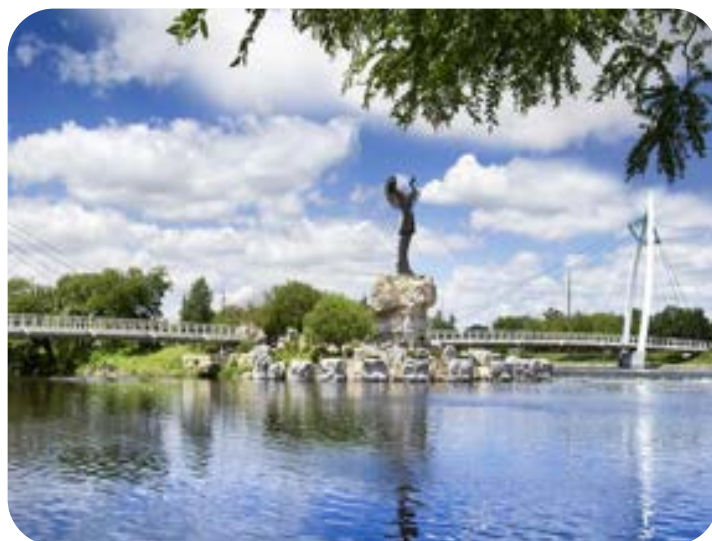
Keeper of the Plains by Blackbear Bosin at the Mid-America All-Indian Museum

Through the years it has made more than 1900 loans to rural Kansans helping them with operating loans of up to $200,000 or real estate loans of up to 250,00, usually in conjunction with FSA. Operating loans are generally on a twelve-month term. Real estate loans (vacant land only) are on a twenty to thirty year term at 6%. Shorter term Bridge Loans are available for those waiting on FSA funding. These are general terms. Wes and the Board try to keep some flexibility to better meet the needs of their borrowers. Today KHRC has more than thirty borrowers with a loan portfolio of more than 2.8 million and reserves that are ready to be put to work.