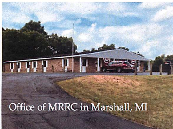
Office of MRRRC in Marshall, MI

Since 2008 the student loan program has been slowly shrinking as demand has changed. In response, the ROAP program has been given particular emphasis and the bulk of MRRRC's loan activity is given over to mortgage loans for small town and rural homes, businesses, and farms. Today, across all of its loan programs, the corporation services over 350 loans ranging from 4,000 to $250,000.