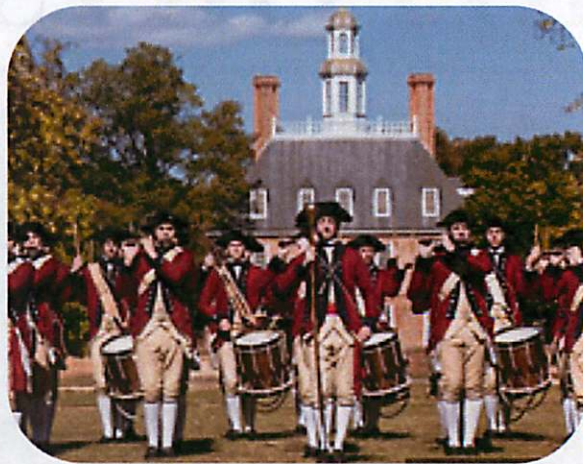
Historic Williamsburg, VA