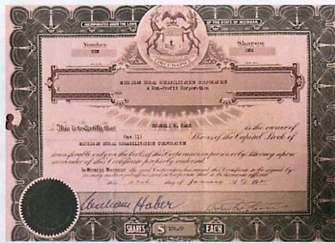
Above, MRRC original stock certificate, 1935