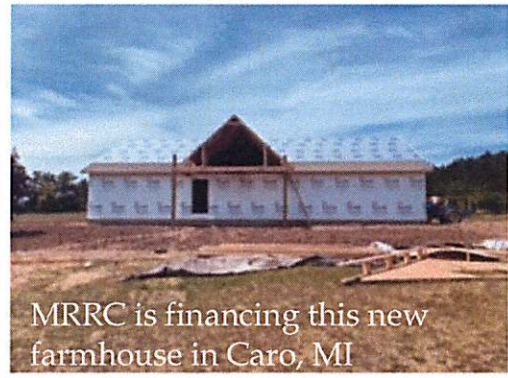
MRRRC is financing this new farmhouse in Caro, MI